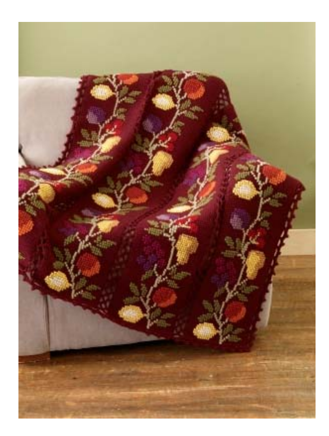
Designed by Nicky Epstein, this Tunisian crochet afghan features harvest fruit with beautiful colorwork.